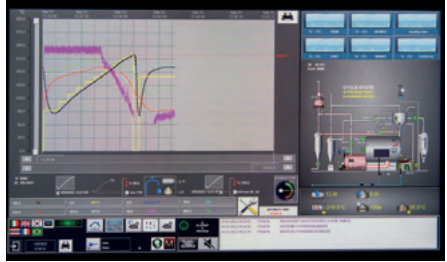
Coffee Roasting Graph Ensures Consistent Roasting Even During Different Ambient Conditions.