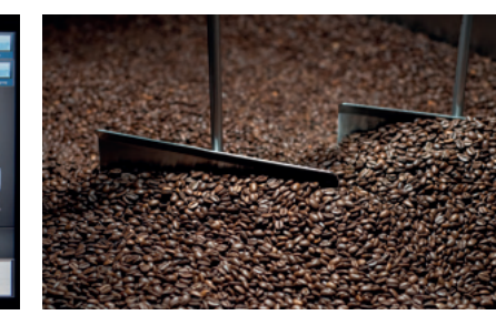
Roasted coffee released from the roaster gently spun in the cooling pan)