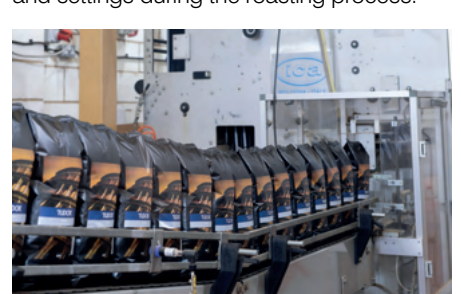
One Way Valve Packaging Freshly packed allows the gas emitted after roasting to escape but not allow air back in