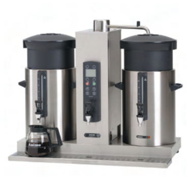
Animo COMBI LINE 10 x 2 W