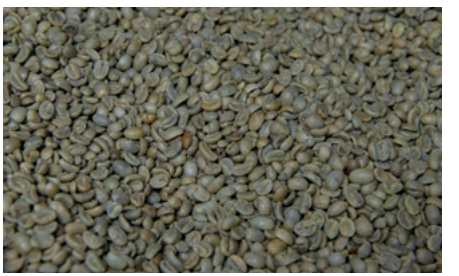
Green Coffee - Raw - Prior To Roasting